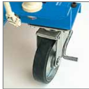
Dual-Action Caster Brake Locks Wheel and Swivel