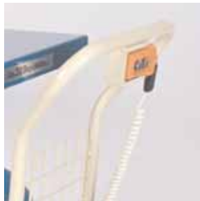
Removable Pendant Push-Button Control in Handle Mount (BxB)