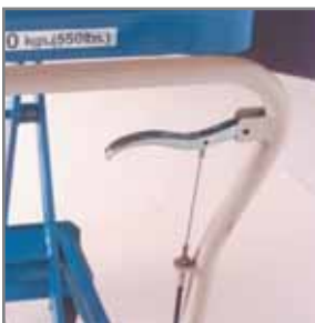
Convenient Hand-Lever Lowering Control For Model BX