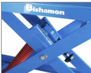
Convenient gauged weight selector knob for adjusting spring resistance