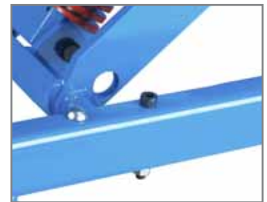
Heavy-duty, scissor locking pin prevents the unit from lowering for maintenance