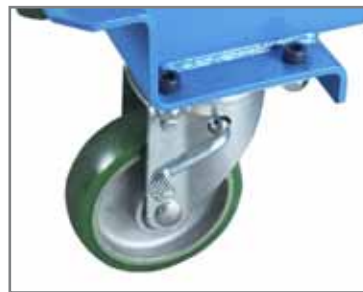
High quality casters with locking brake for smooth transport