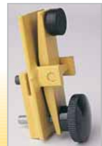
Bishamon brake keeps rotator ring from turning.