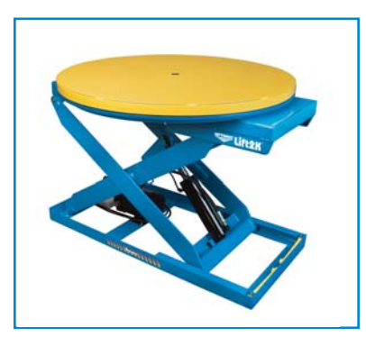
43" Diameter Turntable

480 VAC Motor w/Low Voltage Controls (L3K & L5K only)