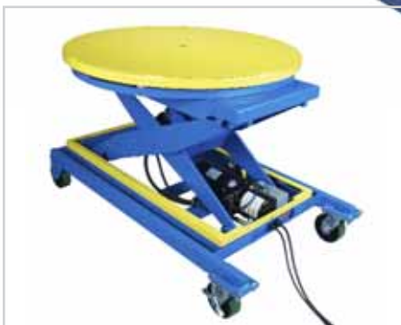
Vision shown with optional turntable top and cart portability

Designed from the ground up, Bishamon Vision® lift tables incorporate design features that provide unequalled performance and safety. They are versatile and heavy-duty work positioners that comply with ANSI standards as well as most requirements of the European CE standard for lift tables. They meet or exceed the required safety clearances on guards, as well as performance and stability requirements.