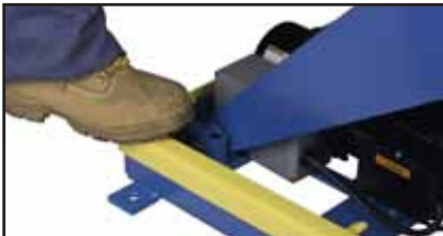
Integral Base Frame Sensor for operator safety