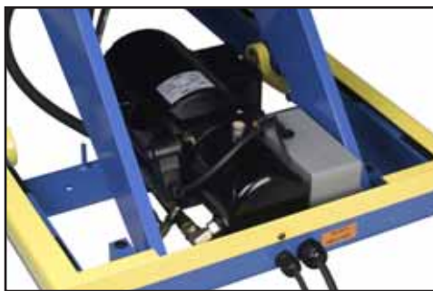
Compact, internal power unit and reservoir combination