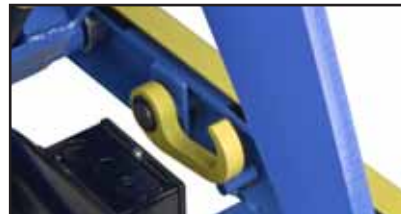
Hinged maintenance catches powder coated safety yellow.