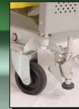
Smooth rolling casters and floor lock