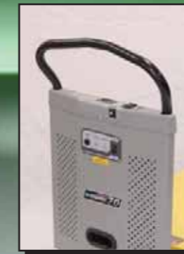
Ergonomic comfort shape handle