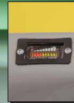
Battery status indicator and onboard charger