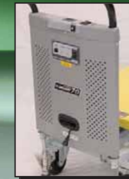
Full shielding of all electrical components