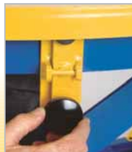
Bishamon brake keeps rotator ring from turning.