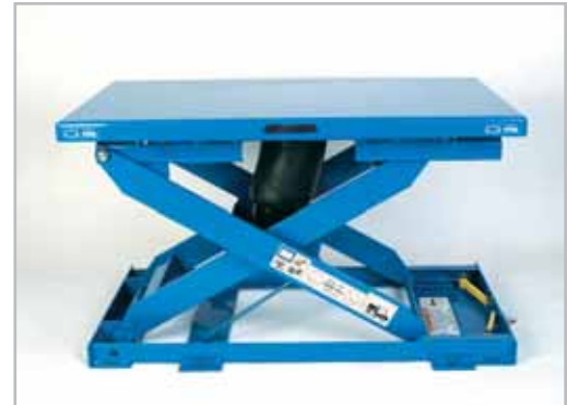
Bishamon EZ Loader with rectangular narrow non-rotating top.