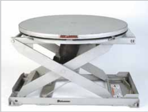
EZ Loader constructed of 304 stainless steel for food and washdown applications.