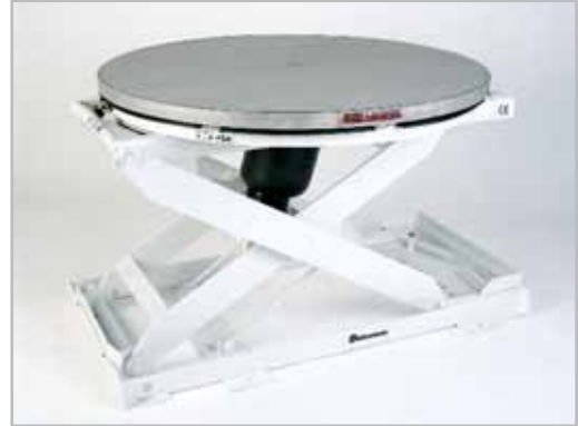
EZ Loader with wash-down package consisting of USDA accepted paint and stainless steel rotating platform.