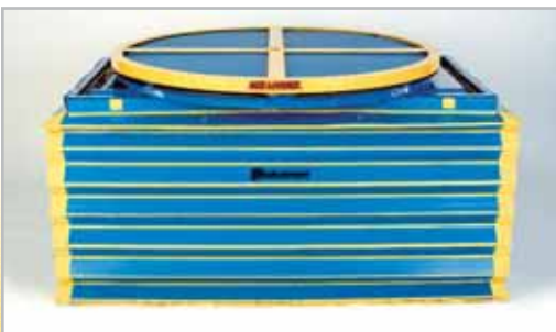
The Bishamon accordion bellows skirting.