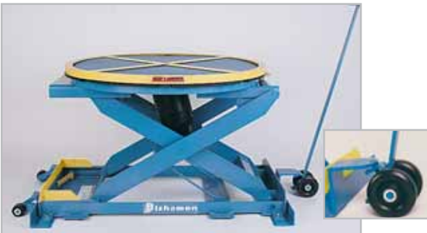
Semi-live portability for moving unloaded lift features two wheels and a dolly handle. Inset is close-up of dolly wheel unit.