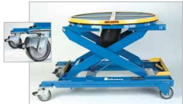
Caster portability cart features two fixed and two swivel casters with brakes. Inset is close-up of swivel casters.