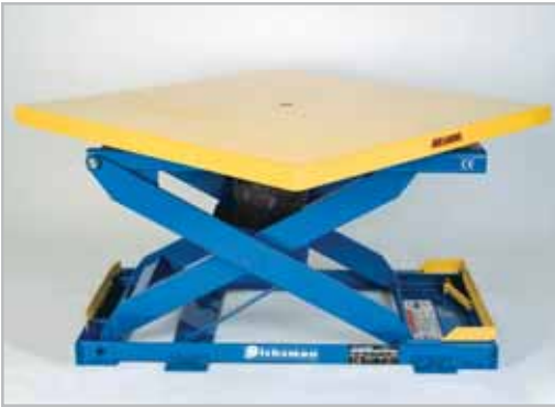
Bishamon EZ Loader with solid rectangular rotating top.