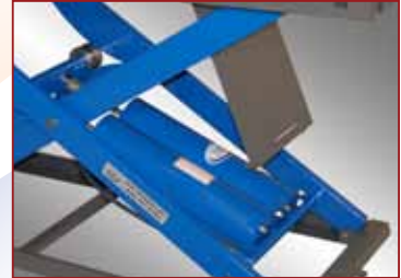
The Ram Squared Twin Cylinder System