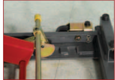
5-Position Safety Locking System