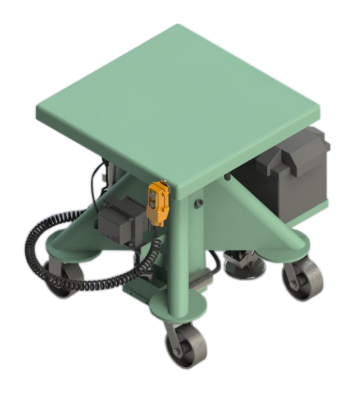
Call Us for Capacities Over 5,000 lbs.

Whether it's a standard, modified or custom design, our dedicated staff will work closely with you to provide you with high quality products that are built to last in harsh, high cycle environments. We've been manufacturing the most robust lifts in the world since 1934. All of our products are manufactured in the United States of America using high quality raw materials and components. Give Lange Lift a call or e-mail us today, we'd love to create an upLIFTING experience for you!