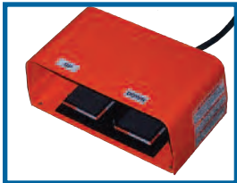
Optional Foot Control