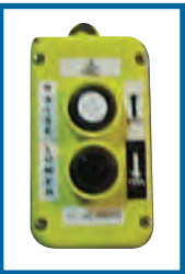
Magnetic Backed Hand Control-Standard