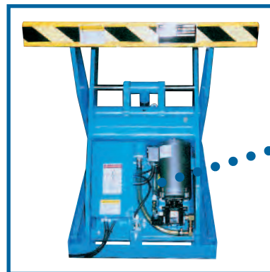
Motor & Controls are easily accessible.

Tables conform to or exceed ANSI MH 29.1-1994/2008