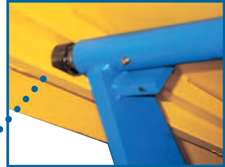
Captured 'Lift-Lok' secures top and base leg rollers.